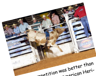
The competition was better than ever at the 2009 American Heritage Futurity.

mitted with payment by the close of books along with a copy of the Age Certification form for each animal. Keep in mind that the way that you enter the animal on the entry form is the way that it will appear in the event roster, unless other arrangements are made. It is important that we have all name changes and partner additions and/or corrections by the close of books in order to ensure that they are changed. Any changes sub-